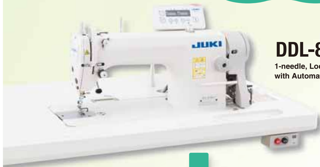
DDL-8700-7 1-needle, Lockstitch Machine with Automatic Thread Trimmer

The DDL-8700-7 is provided with the "new model control box" and the "new model compact servomotor," thereby substantially saving energy.