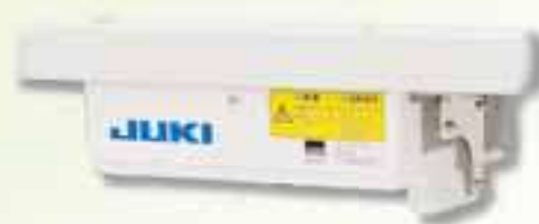
SC-920C The new model control box