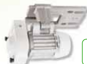
M92 The new model compact-size servomotor